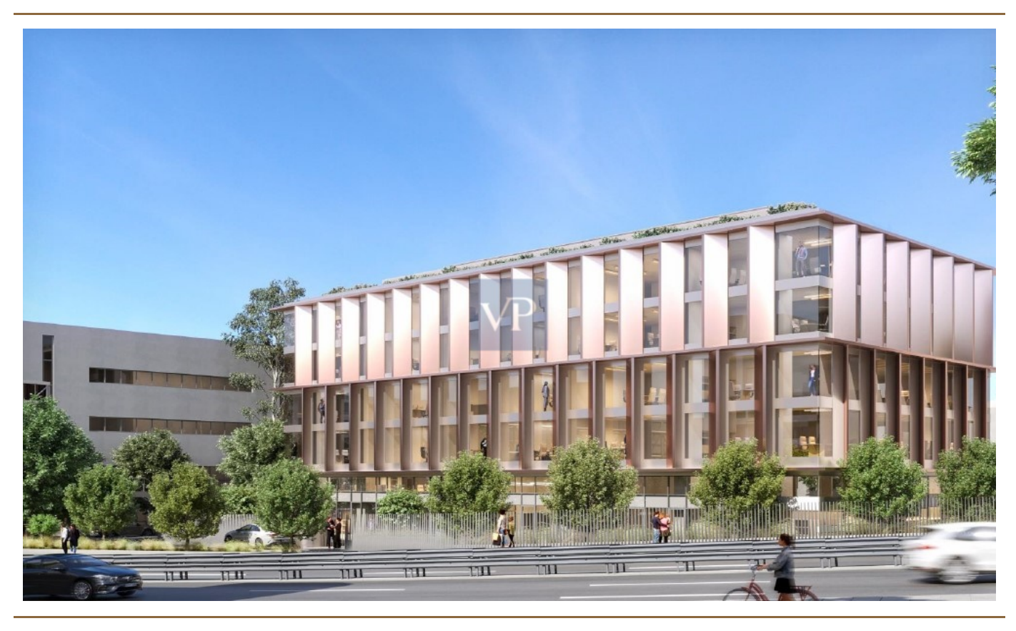
RENT PRICE: 25.322 EUR