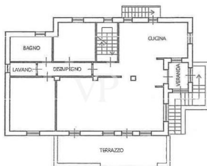
PIANO PRIMO H. = mt. 2,90